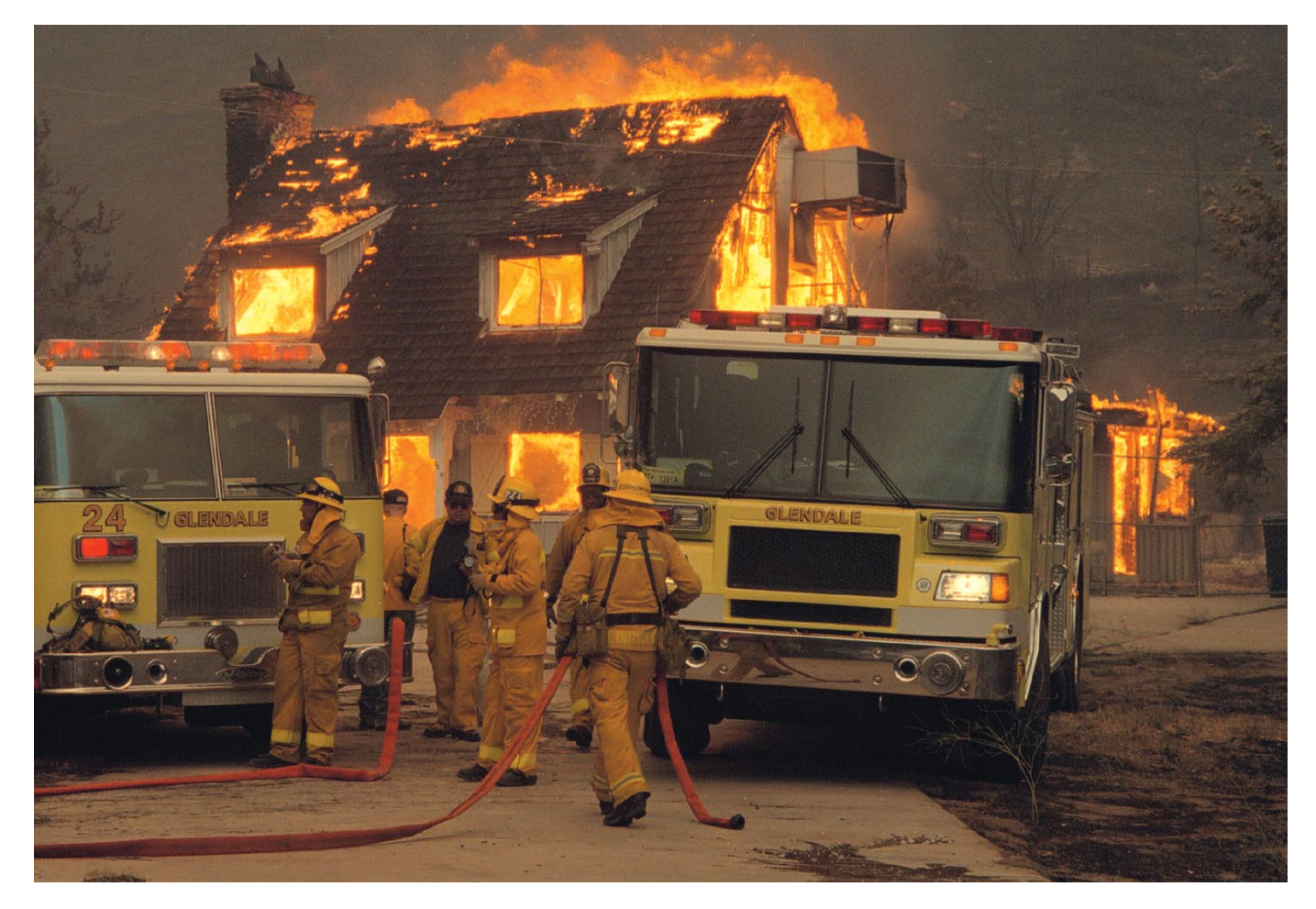
Glendale firefighters wrap up hose lines after they ran out of water fighting a house fire Saugus, California.